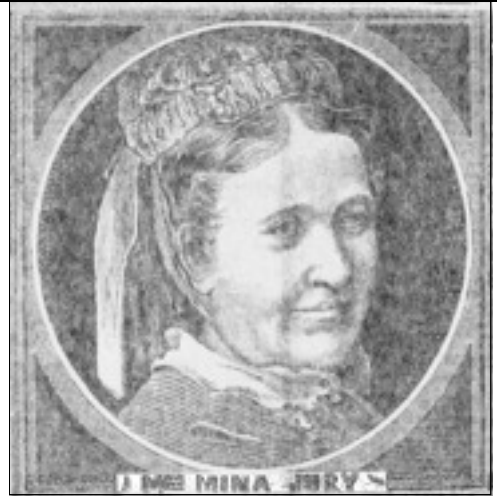
The Illustrated Police News (London), 5 Dec 1874