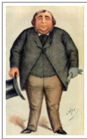
Arthur Orton, Vanity Fair , 10 Jun 1871

A few years later in London, a criminal case was unfolding that would become one of the longest, most expensive, and widely reported in Britain for the time. Arthur Orton, a butcher from Wagga Wagga, claimed to be the missing heir to the Tichborne Baronetcy, Sir Roger Tichborne, only to be suspected and prosecuted as an imposter. The trial lasted 188 days, took the judge 18 days to sum up and cost £200,000. 12