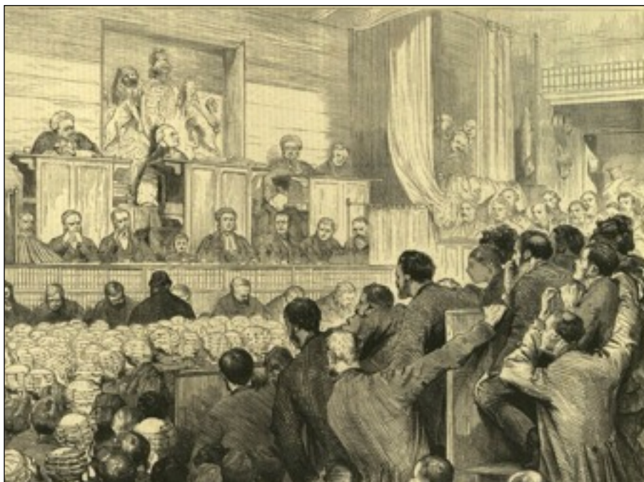
The Tichborne Trial: Scene in the Court House during the delivery of the verdict.